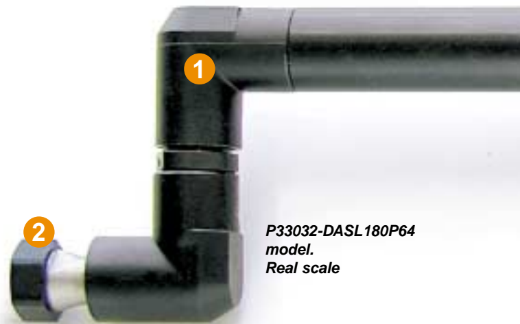
P33032-DASL180P64 model. Real scale