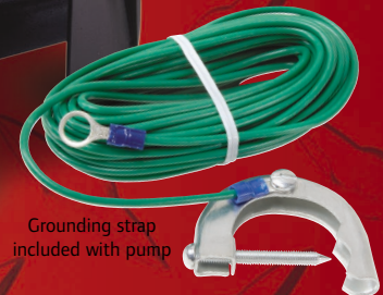
Grounding strap included with pump

See reverse side for ordering information.