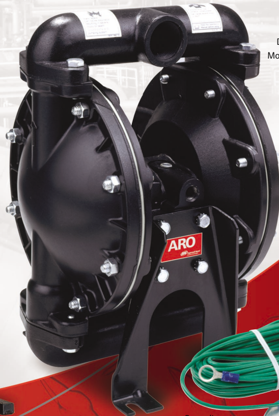
1" CSA Certified Diaphragm Pump Model 6661H0-1C9-C